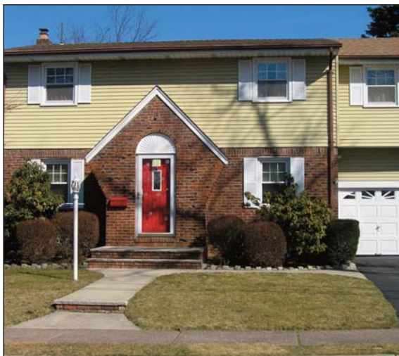
Our community home in Fair Lawn.