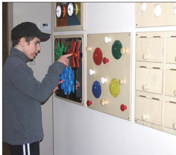
Our community homes include multi-sensory rooms to help special needs children and adults explore and develop their senses and skills.