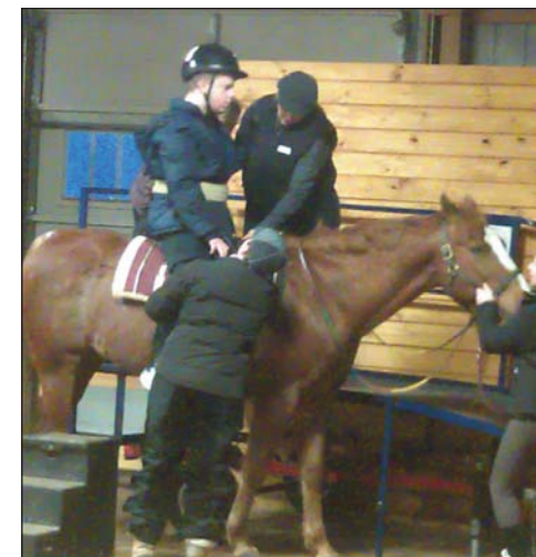
Therapeutic riding lessons.