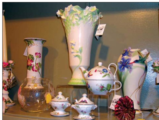
Some of the unique home goods found at The Depot.