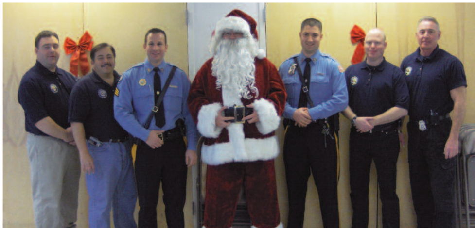
Generous Paramus Police Reserves with Santa Claus.