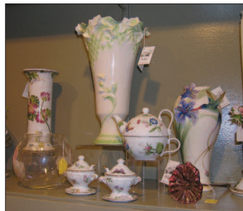
Some of the beautiful, handmade items featured at The Depot.

For more information or to schedule a date, please call our Volunteer & Community Relations Manager at 201.261.2800 x222.