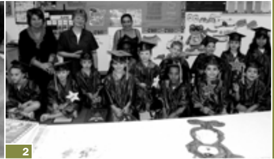
Class of 2004: TCDC's first kindergarten graduates.