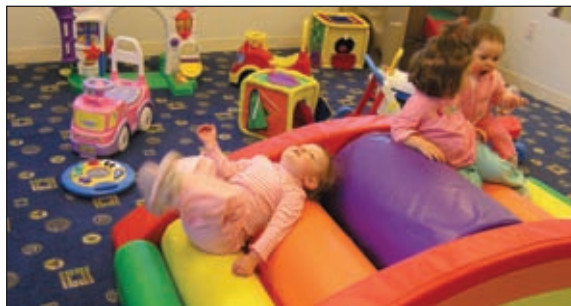
New walkers love the Waddler Room, one of the special extras at the Turrell Center.

For more than 30 years, thousands of Bergen County working families have chosen Turrell Child Care & Early Learning Center, located at 200 Robin Road, Paramus, NJ, to nurture their little ones. The Turrell Center serves children ages 8 weeks through kindergarten, and is open 7:00 a.m. - 6:30 p.m. Monday through Friday.